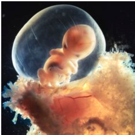
This child is 8 weeks old in its mother's womb.

God our Creator, we give thanks to you, who alone have the power to impart the breath of life as you form each of us in our mother's womb; grant, we pray, that we, whom you have made stewards of creation, may remain faithful to this sacred trust and constant in safeguarding the dignity of every human life from the moment of conception to the moment of natural death. Through our Lord Jesus Christ, your Son, who lives and reigns with you in the unity of the Holy Spirit, one God, for ever and ever. Amen