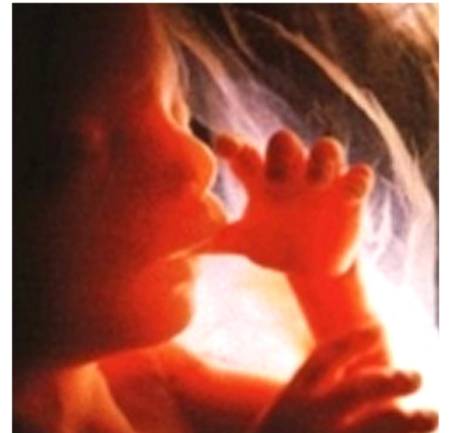
This child is 19 weeks old in its mother's womb.

This weekend you will find empty baby bottles at the main entrance of each of our four parishes. These baby bottles are for your use to take home and fill with your spare change. When your bottle is filled, please place it in the Sunday collection basket or bring it to the Parish Office. The monies collected from your spare change will go toward supporting the Living Alternatives Pregnancy Resource Center of Lincoln that serves all of Logan County. See the flyer stuffed into this Sunday bulletin this weekend for more details and contact information. Please make a donation to this life-changing/life-saving ministry!!