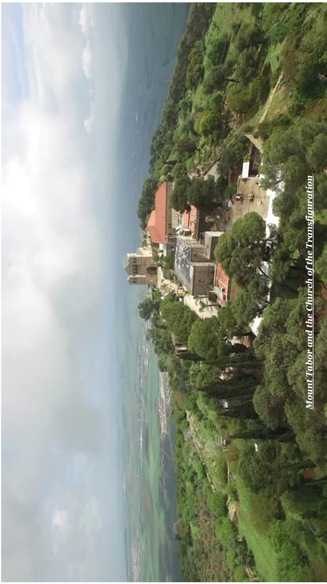
Mount Tabor and the Church of the Transfiguration