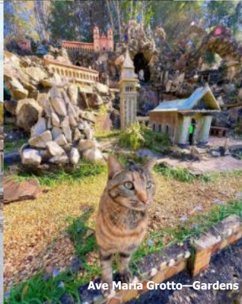
Ave Maria Grotto—Gardens

Please check your calendars and let us know if you are interested to come on this exciting journey!