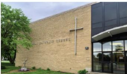
Carroll Catholic School Preschool - 8th grades