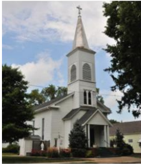
St. Patrick 213 S Bogardus St, Elkhart