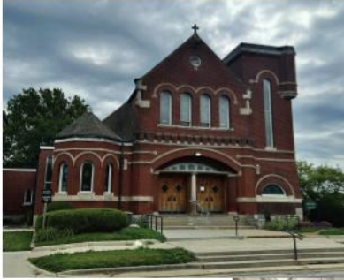
Holy Family 316 S Logan St, Lincoln

Mass times: Saturday 4:00pm Sunday @ 10:00am