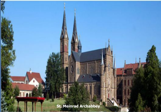
St. Meinrad Archabbey