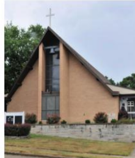
St. Thomas Aquinas 321 Lafayette St, Mt. Pulaski