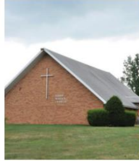
St. Mary 808 NW Pearl St, Atlanta