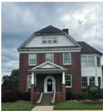
Logan County Parish Office 316 S Logan St, Lincoln IL 62656 217.732.4019