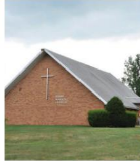
St. Mary 808 NW Pearl St, Atlanta

Mass times: Saturday 4:00pm Sunday @ 10:00am