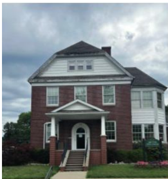
Logan County Parish Office 316 S Logan St, Lincoln IL 62656 217.732.4019