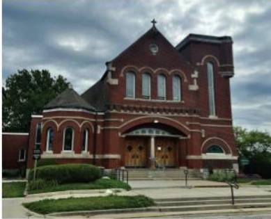
Holy Family 316 S Logan St, Lincoln

Mass times: Saturday 4:00pm Sunday @ 10:00am