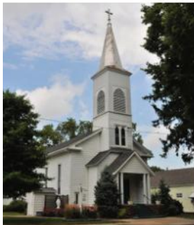
St. Patrick 213 S Bogardus St, Elkhart