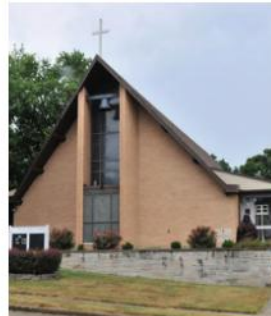
St. Thomas Aquinas 321 Lafayette St, Mt. Pulaski