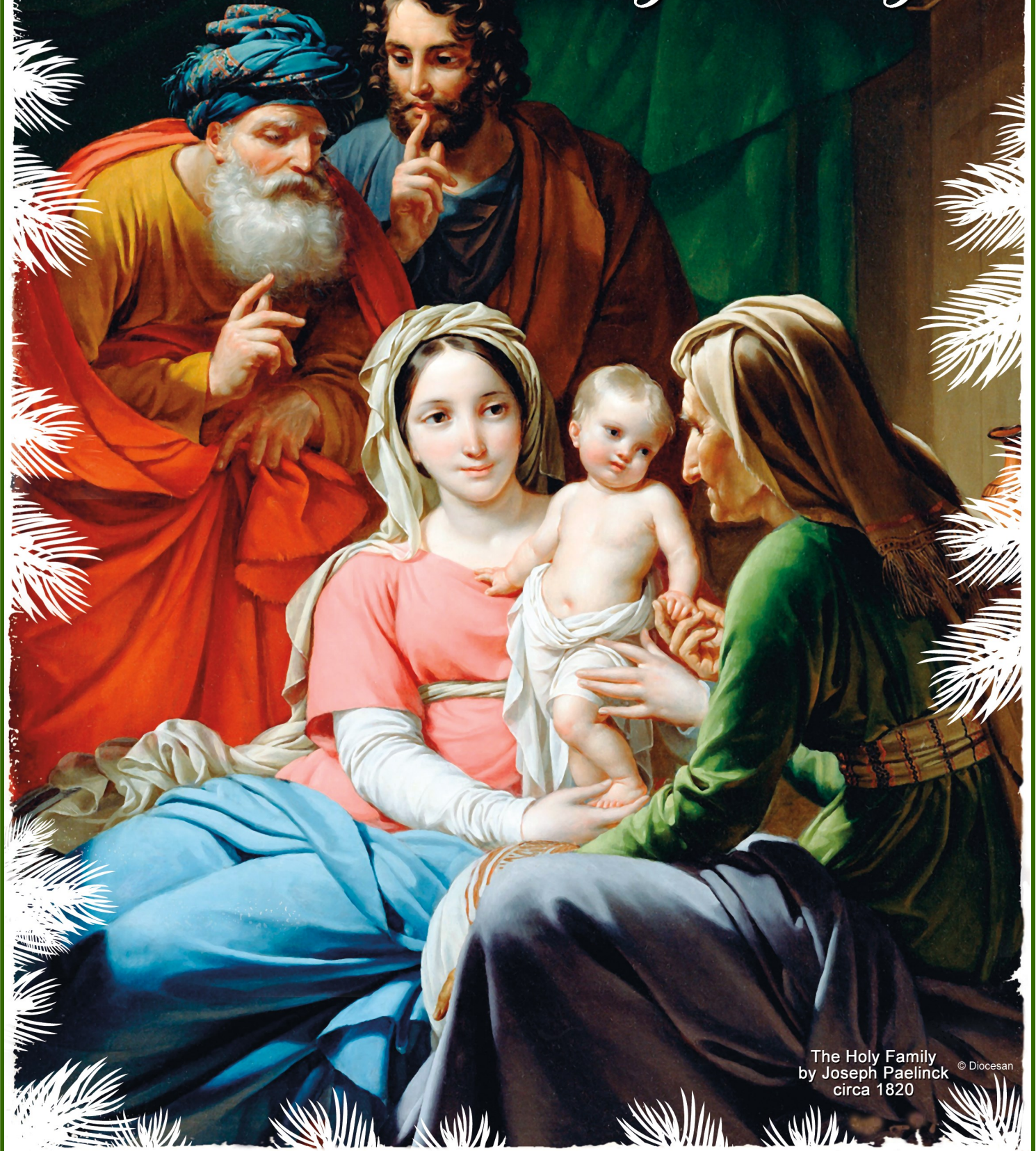
The Holy Family by Joseph Paelinck circa 1820