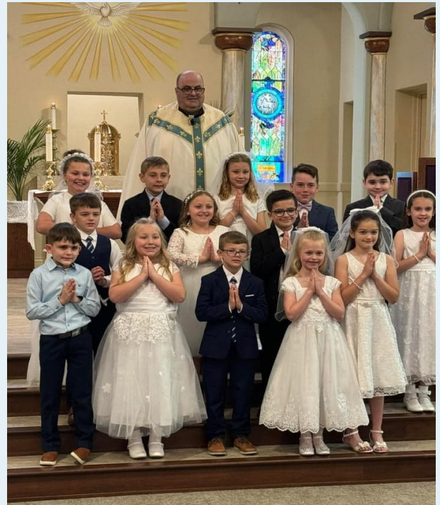
Many thanks to all the teachers for preparing and leading these students to their First Communion!