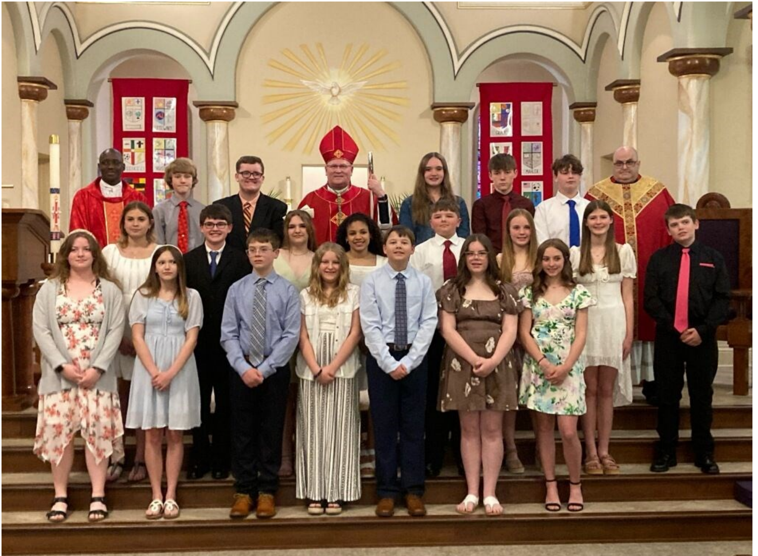
Photo of Holy Family and St. Mary Confirmands